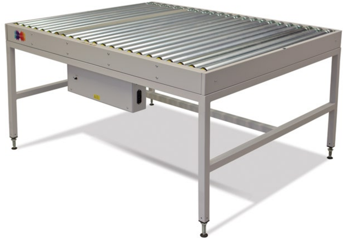
PLATE LINE AUTOMATION